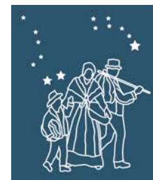
Next Stop Freedom

OAKVILLE MUSEUM AT ERCHLESS ESTATE 8 NAVY ST. 905.338.4400 WWW.OAKVILLEMUSEUM.CA